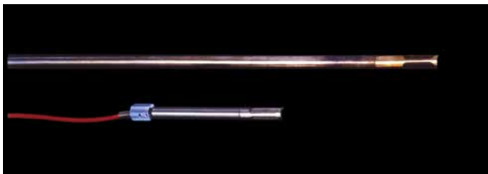
High temperature (top) and mid-temperature probes