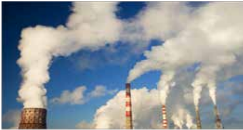
Incinerator exhaust pipes