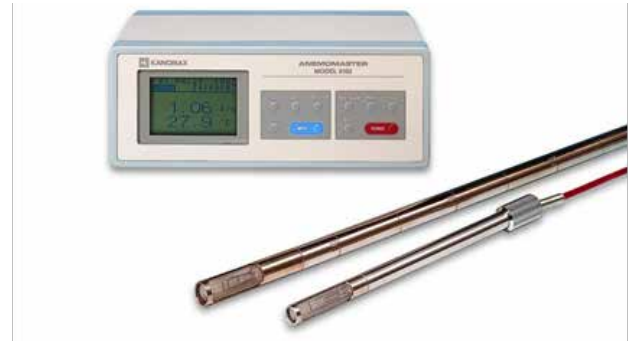
Model 6162 High Temperature Anemometer

Kanomax manufactures the model 6162 high temperature anemometer that can be used to measure airflow in the applications mentioned above. The instrument comes with a number of features and benefits that can solve the problem of measuring air flow in a high temperature environment.