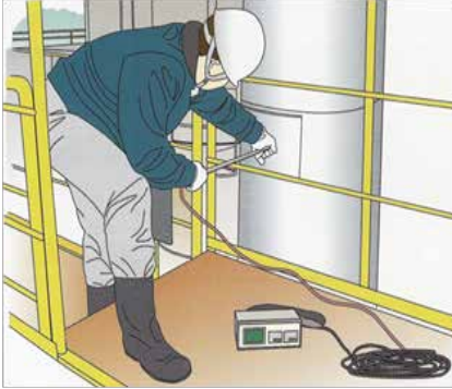
A technician uses the 6162 to measure air flow in the flue

result in a dirtier burn that produces more waste/pollution or wastes energy and time with an inefficient burn. In order to make sure this occurs the airflow must be precisely measured and controlled.