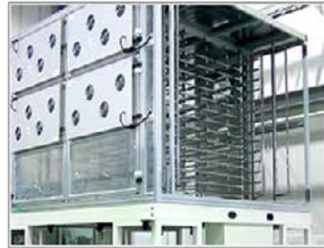
LED Panel drying process

The drying process consists of the removal of water or another liquid via evaporation. In most cases an air flow applies the heat by convection and then carries away the released water vapor (humidity). The process is often used in food processing industries to dry product prior to it being packaged for sale. Improper airflow or heating can result in undesirable texture or taste of the final product, and it also affects the efficiency of the drying. Nuts, fruit and ramen are dried in bulk and in order to maximize production the best practice is to only dry the food as long as is necessary and not any longer; this requires precise control. Drying is also used in other industries such as film and panel manufacturing and pharmaceutical processing. The air flow needs to be monitored to ensure the product is being evenly exposed to the heated air so it dries uniformly and without warping or other distortion in the case of LED panels.