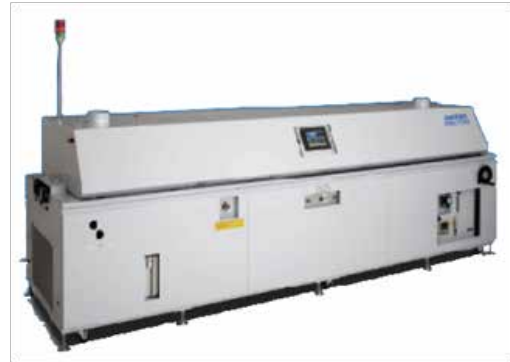
Examples of an incubator (bottom left) and a reflow oven (above) that may be tested for quality purposes with a high temperature anemometer prior to being sold